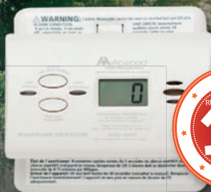
NON-DIGITAL DISPLAY ALSO AVAILABLE